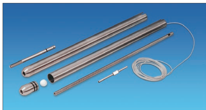
Point Source Bailers come in standard lengths of 2 ft. (610 mm), 3 ft. (910 mm), or 4 ft. (1220 mm)