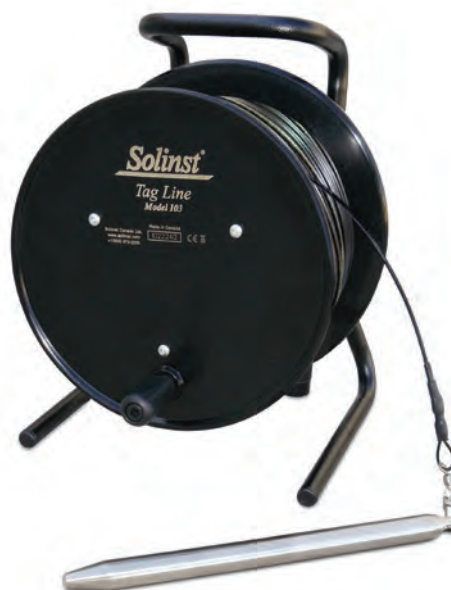
Tag Line / Suspension Cable