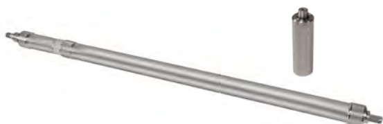
425-D Deep Sampling Discrete Interval Sampler and Weight