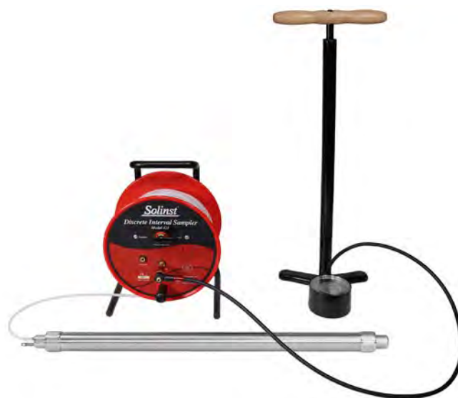
1.66"ø Discrete Interval Sampler with High Pressure Hand Pump

Biodegradable disposable PVC bailers and stainless steel Point Source Bailers are also available from Solinst (see Model 428 BioBailer & 429 Point Source Bailer Data Sheets).