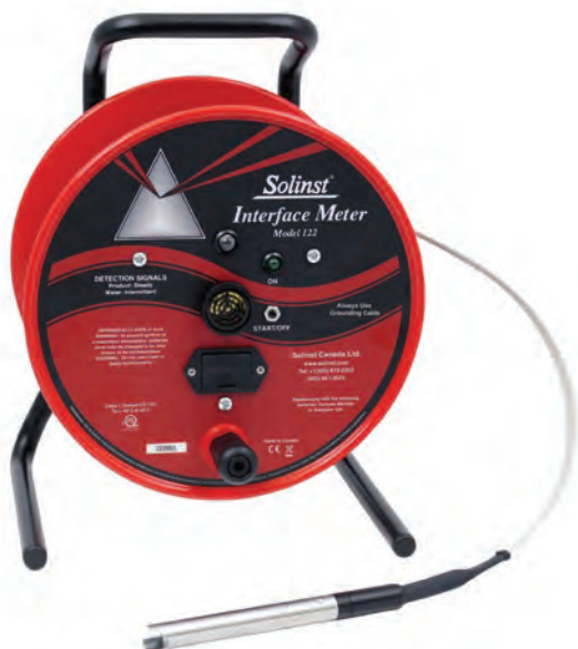
Oil/Water Interface Meter