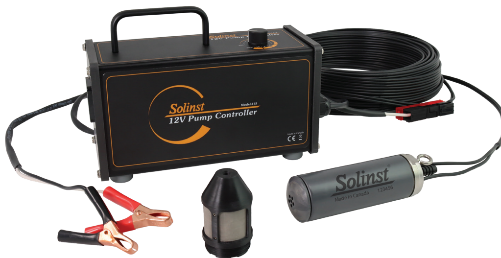
(Optional Water Filter)